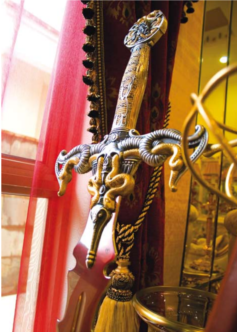
LEFT: An antique sword — one of the many souvenirs in the house OPPOSITE PAGE: A cosy lounge area made charming by stunning ceiling details

THE COUPLE TOOK THEIR TIME TO INSPECT THE PROPERTY AND LIKED WHAT THEY SAW. “IT LOOKS SMALL FROM THE OUTSIDE, BUT ACTUALLY HAS A LOT OF DEPTH”