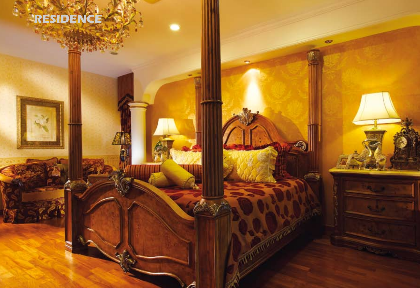
ABOVE: The master bedroom is royally furnished with rich fabrics and colours BELOW: Colourful crystalware makes the bathroom a pretty sight

look appeals to us because not only does it afford a grand ambience, classical designs also do not go out of fashion,” he says. “The Italians are wonderful designers and much of their furniture also just has that ‘right’ look. We’re still using some of the older pieces we had because they go well with the new furniture.”