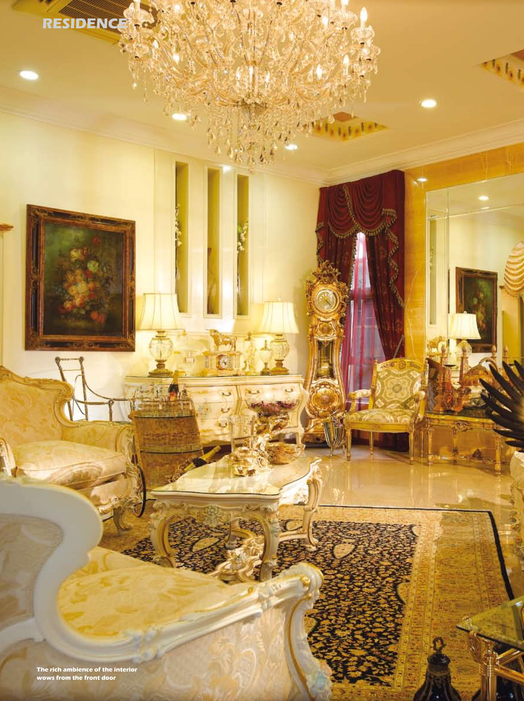
The rich ambience of the interior wows from the front door