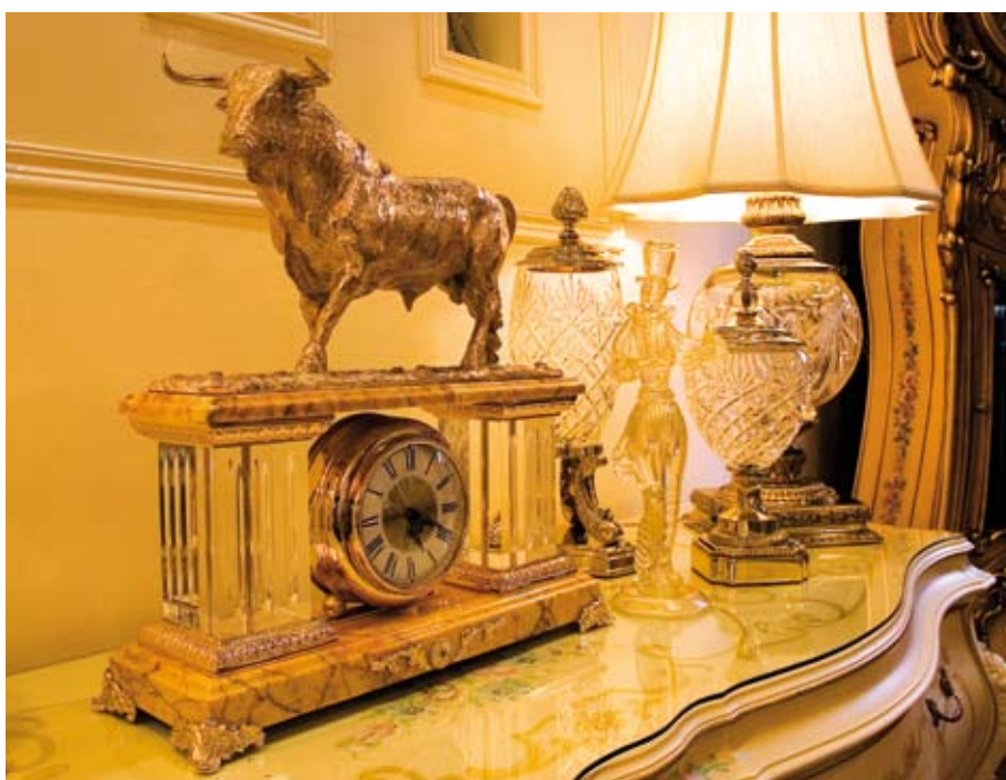
ABOVE: Some of the decorative pieces the owners have collected TOP: The dining area features a three-metre long dining table and chairs with beautiful floral motifs

Mohamed Raffi on his part has kept an eye out for beautiful chandeliers, installing an impressive piece on the second floor where the library and family recreation area are located. “The classical